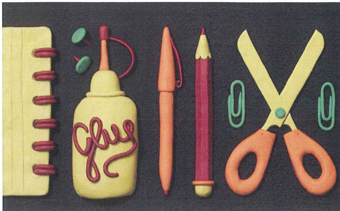
▲ SCHOOL SUPPLIES JOHN R. GREEN STORE

Parents, meet John R. Green. Many of the supplies this Covington educational superstore are of the classroom-equipping variety, but there's no reason you can't stock up on math flashcards from Trend Enterprises, science workbooks from Classroom Complete Press, or wall maps from House of Doolittle. You'll also find binders, pencils, stickers, toys, games, and activity kits from the likes of Crayola and Scholastic. Who needs recess?